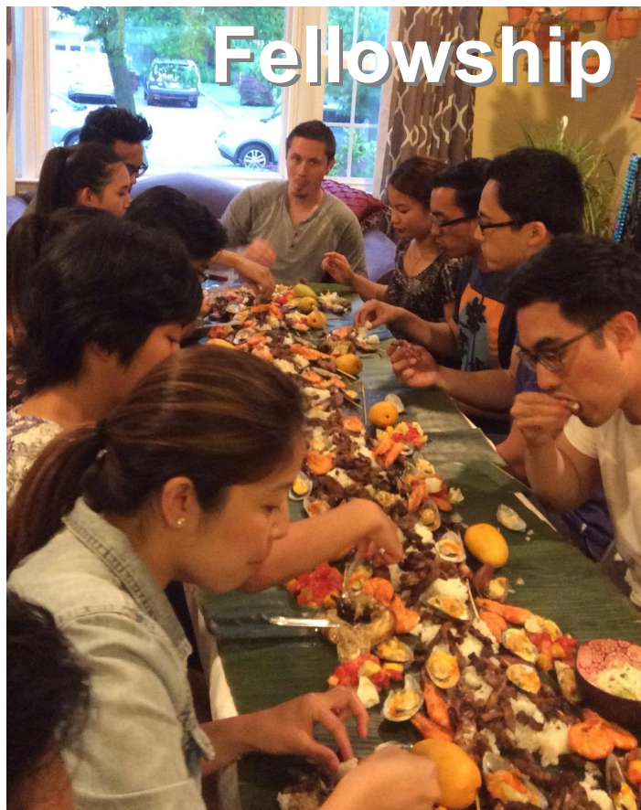
Kamayan (eating with bare hands): Post-High School young men and women eating the Filipino way