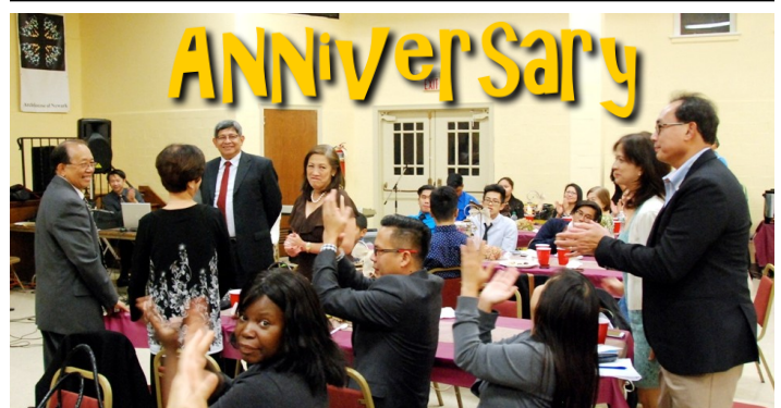
Acknowledging the founding members of FOF