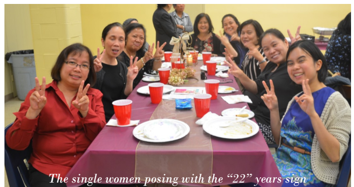
The single women posing with the "22" years sign