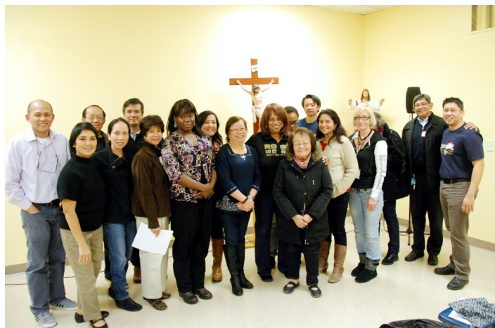
The LSS participants with the LSS Service Team after the last session.