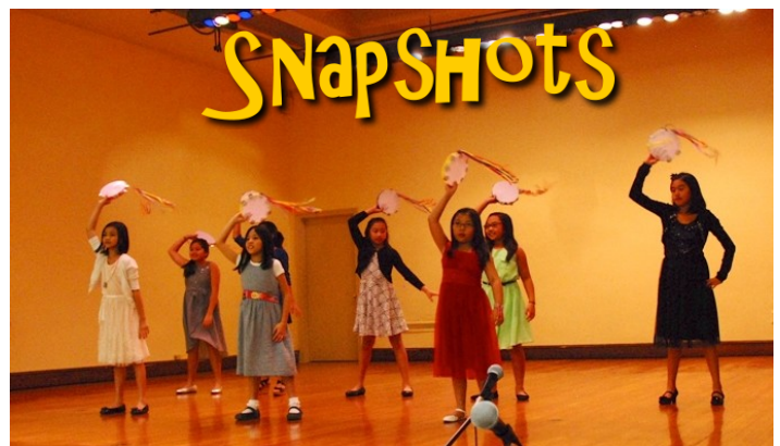
The FOF girls performing their tambourine dance