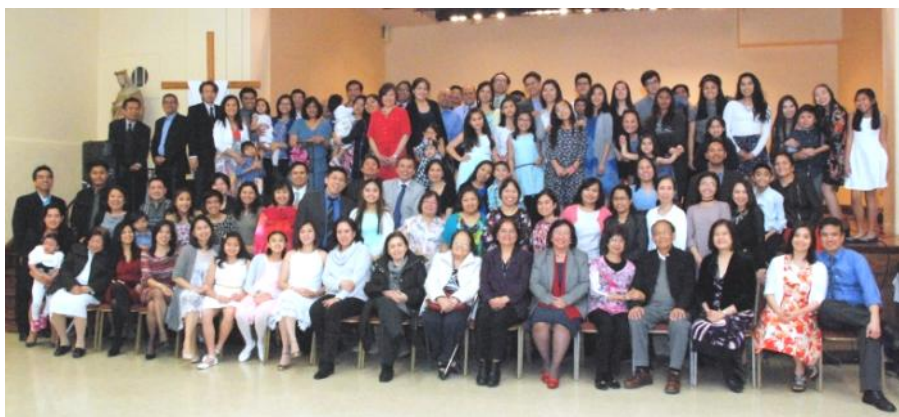
Community Easter Celebration (April 10, 2016)