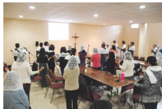
Publicly Committed Members Meeting (April 2, 2016)