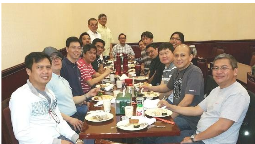
Men's Lunch Fellowship (May 21, 2016) Tepanyaki Grill, East Brunswick, NJ