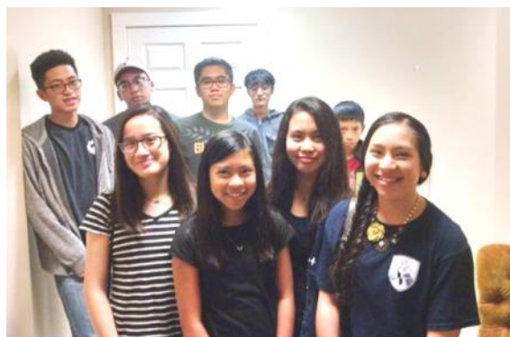
Bridge Retreat, St. John's Church Dunellen, NJ (May 14, 2016)