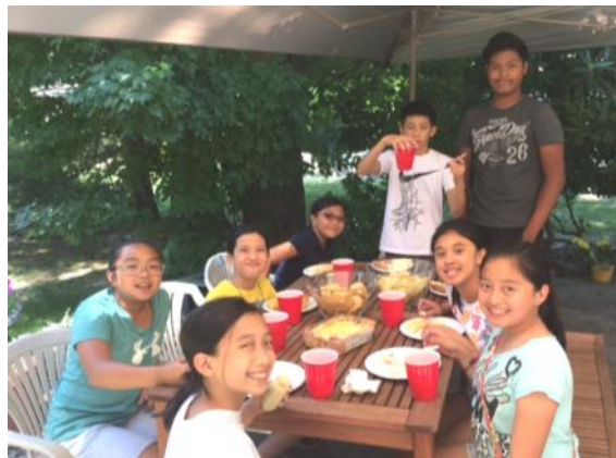
Children of Faith Summer Fellowship Day East Brunswick, NJ (June 25, 2016)