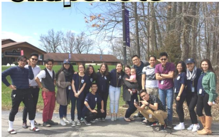
Our Youth Group at the YES Retreat in Hillsdale, MI (Apr 1-3, 2016)